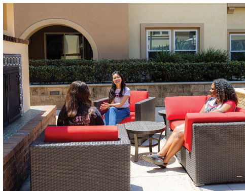
Chapman Court, the university’s newest residential facility in the Platinum Triangle, offers many amenities to attract students who want to experience off-campus living.

“The campus residential experience is an important part of what makes the Chapman student community so meaningful,” said