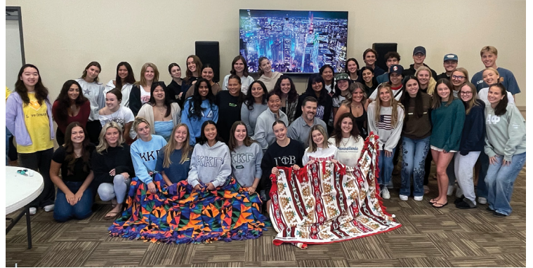
Students representing Chapman’s Panhellenic organization made over 80 blankets for Marines stationed overseas on Love Orange City-Wide Volunteer Day.

The no-sew blankets, chosen for their warmth and ease of assembly, were the perfect project for a wide range of volunteers, regardless of crafting skill. As the students worked together, the room filled with conversations, laughter and a strong sense of purpose. Their initial goal was to complete 50 blankets by the end of the day. With so many hands on deck, they were able to exceed expectations, completing a total of 80 blankets—an amazing accomplishment and a meaningful contribution to the Marines.