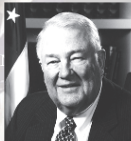
EDWIN MEESE, III