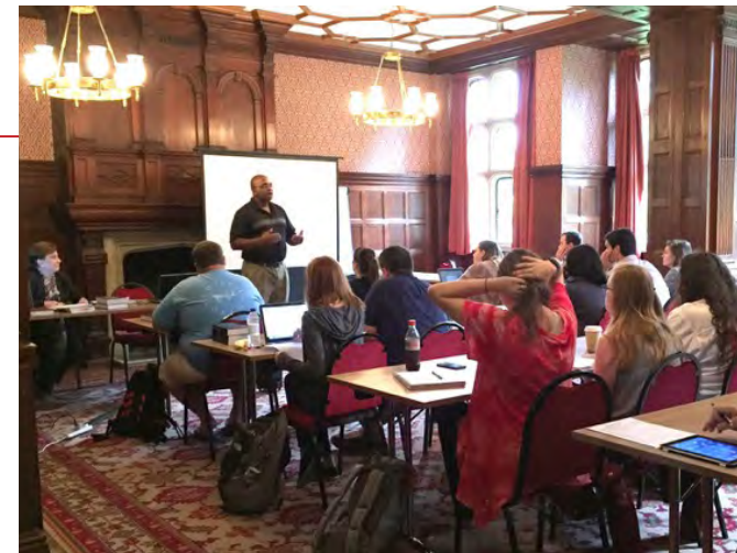
Class in session at Sidney Sussex College

the Cambridge Shakespeare Festival, the Globe and the Royal Shakespeare Company. This course is hands-on learning of persuasive advocacy skills through classical dramatic exposure. This is a unique opportunity to experience the drama of the law while in the land of Shakespeare.