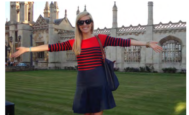
So much history!