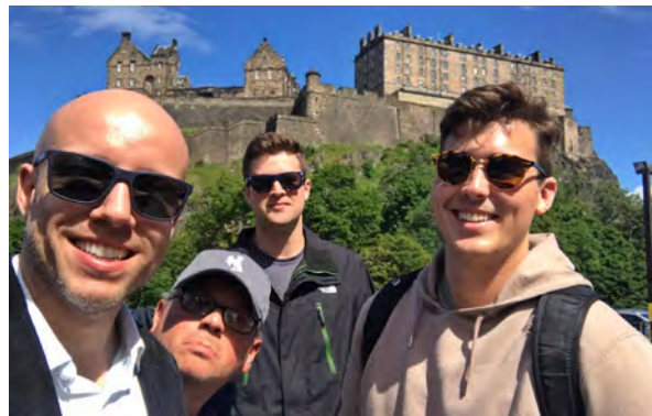
Guy's weekend in Scotland