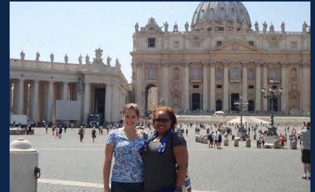
Weekend in Rome, Italy