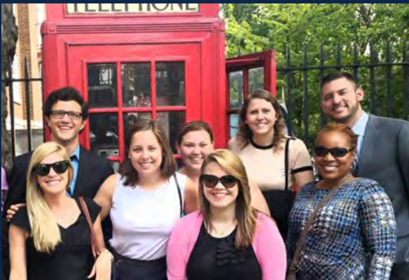
Seeing the sights of London

In compliance with Title VII of the Civil Rights Act of 1964, Title IX of the Education Amendments of 1972, Section 504 of the Rehabilitation Act of 1973, and all other applicable non-discrimination laws, Samford University does not discriminate on the basis of race, color, national or ethnic origin, sex, age, genetic information, disability, or veteran's status in its educational programs and activities, admissions, scholarship and loan programs, athletic and other school administered programs, and employment. Samford is a religious educational institution and is exempt from certain provisions of Title VII of the Civil Rights Act of 1964 and of Title IX of the Education Amendments of 1972.