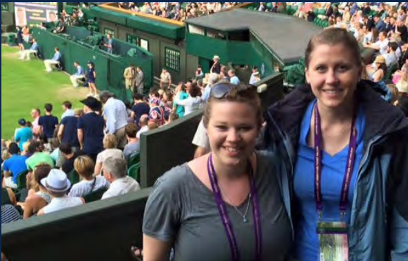
At Wimbledon in London