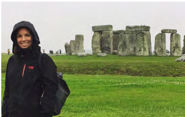
Quick trip to Stonehenge

But, why would you want to cancel the chance to have opportunities like these?