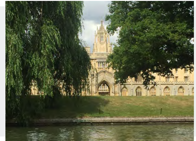
Just a few of the sites of lovely Cambridge