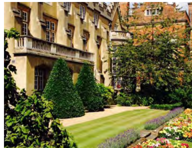
The gorgeous gardens at Sidney Sussex College