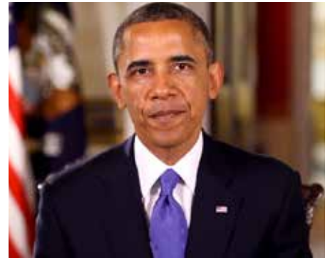
President Obama calls on presidents of colleges and universities to make an institutional commitment to interfaith work.

A number of institutions demonstrated this climate of interfaith cooperation on their campuses through plans and reports submitted to the White House. In the first year alone, President's Challenge campuses have involved over 200,000 participants in their interfaith service and interfaith engagement initiatives. Faculty, staff, and administrators from diverse academic and administrative offices planned and executed President's Challenge events and thousands of faith-based and secular student organizations organized and participated in interfaith service initiatives. These projects have