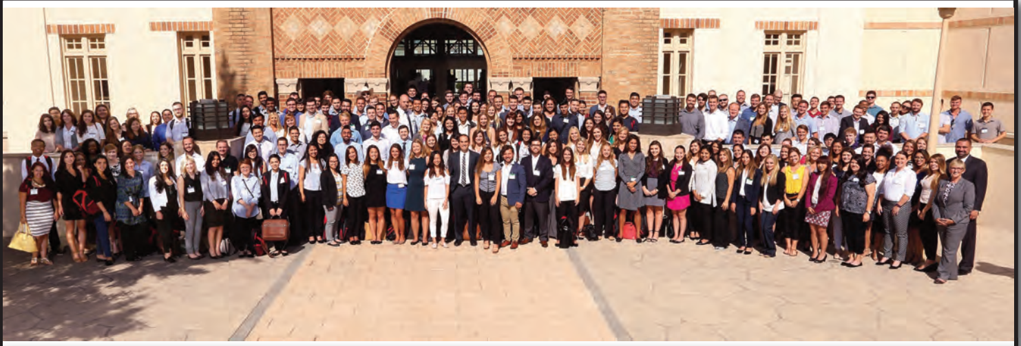
First Day of Launch Week - Fall 2016